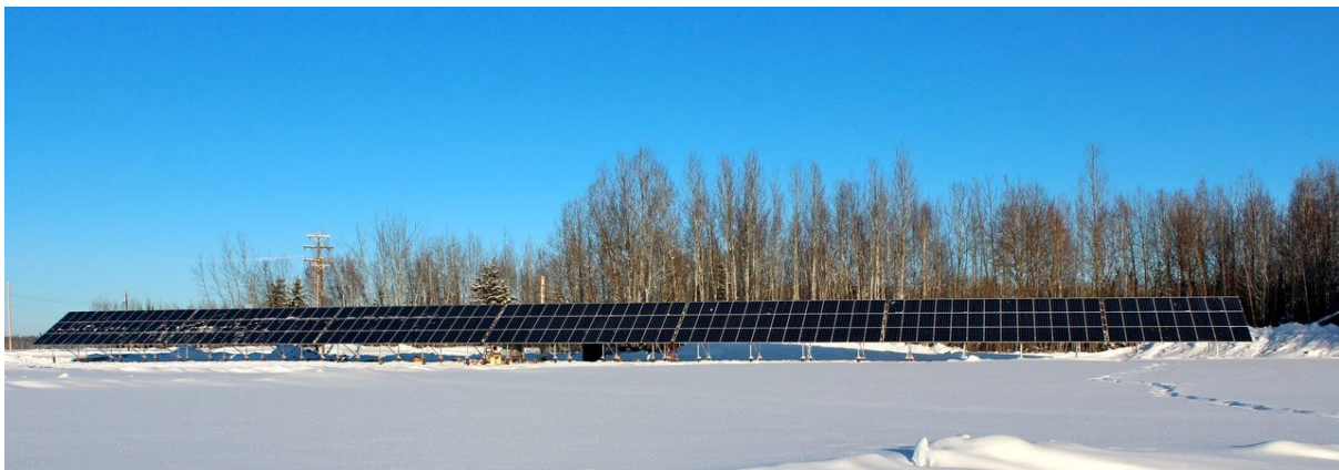
Figure 1: Fort Simpson is Northwest Territories Power Corporation's largest diesel-powered community. This 61 kW system (the largest north of 60° in Canada) will help displace 15 000 L of fuel annually and provide up to 8.5 % of the village's minimum power requirements during the summer.

The Northwest Territories developed a "Solar Energy Strategy 2012-2017" 5 that aims to displace 20 % of diesel-powered generation with solar PV in 25 diesel powered communities. The strategy includes development of a monitoring program that can be used to model PV production in northern climates.