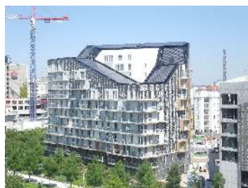
Figure 2 – Low-energy building in Paris' 17 th arrondissement. 96 kW BIPV designed and installed by Sunvie.

The RT 2012 thermal regulation sets the maximum permitted primary energy consumption level for new buildings at 50 kWh/m 2 per year. This regulation offers new growth opportunities for France's solar power sector (Figure 2 shows an example of a low-energy building constructed in accordance with RT 2012). Furthermore, this regulation is an intermediate step towards a future regulation (RT 2020, the so-called BEPOS positive-energy buildings), under which new buildings will be required to become net producers of energy.