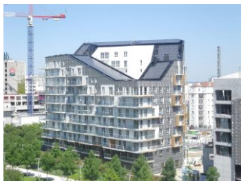
Figure 2 – Low-energy building in Paris' 17 th arrondissement. 96 kW BIPV designed and installed by Sunvie.

The RT 2012 thermal regulation sets the maximum permitted primary energy consumption level for new buildings at 50 kWh/m 2 per year. This regulation offers new growth opportunities for France's solar power sector (Figure 2 shows an example of a low-energy building constructed in accordance with RT 2012). Furthermore, this regulation is an intermediate step towards a future regulation (RT 2020, the so-called BEPOS positive-energy buildings), under which new buildings will be required to become net producers of energy.