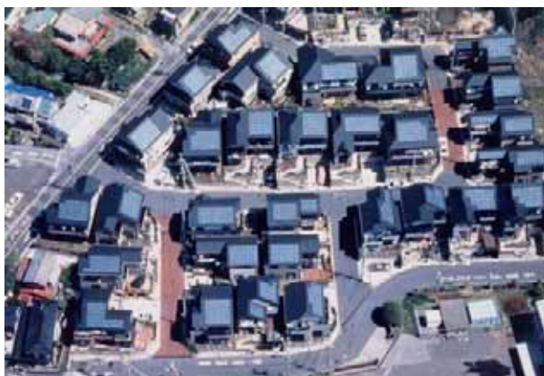
< Villa Garten Shin-Matsudo >